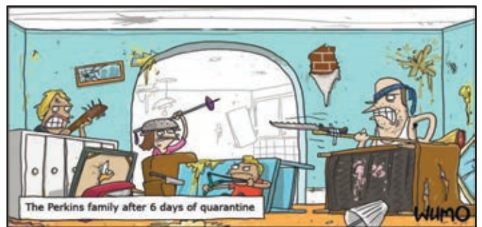
They forgot to pray the daily Rosary.*